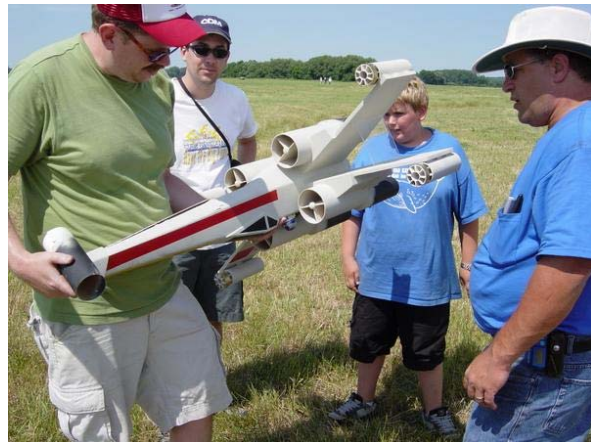
Eric Maher's scratch built X-Wing Fighter