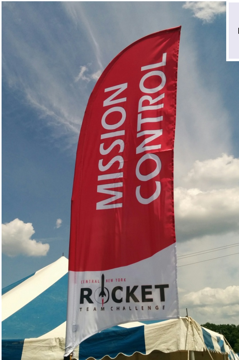
Left: Here's where it all comes together. Top right: Heading for the pad. Bottom right: Star Hunters win their division.