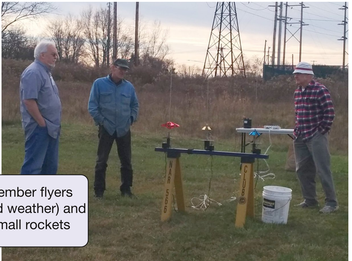
Intrepid November flyers (actually not bad weather) and some quite small rockets