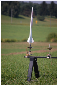
Semroc Retro-Repro Trident ready to launch

gain an additional burst of speed as it plowed into the field. I was heartbroken. Paper tubes were not designed to withstand such force and when I arrived at the scene of the crime there were no sur-