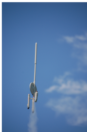
Boldly Going Into The Future

May 10th will begin the SRC's 15th Launch Season. Plans have been put in place to make this special anniversary season one of the club's best ever. We can't do it though, without you. All it takes on your part to ensure success, is participation. Come to meetings when possible. Set time aside for the monthly launches and special events. Tell your friend's, family and co-workers about your hobby and encourage them to check it out with you.