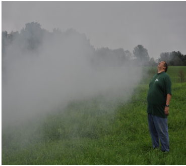
Striking the Rocketeer Pose

After the adrenalin rush that accompanies massive online purchasing had subsided, I turned my thoughts to solving the small technical detail of where I would be able to launch. With a few well thought out search terms (Rocket, Club, Syracuse, NY) I discovered the Syracuse Rocket Club web site. Little could I imagine the path I would soon find myself upon.