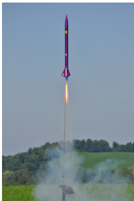
My LOC Nuke Pro Maxx

"The SRC Royalty will be exempt from paying dues for 2013 and shall have the privilege of first launch at all club launches throughout the year"