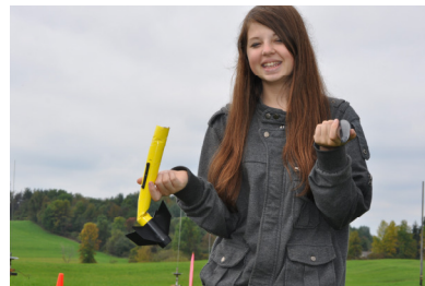
Things don't always go as planned!

With a familiar "whoosh" the rocket left the pad, quickly reached apogee and turned toward ground. Seconds passed as the rocket rapidly gained speed, embracing the force of gravity on what appeared to be a suicidal mission to kiss mother earth. Finally, the saving puff of the ejection charge was observed, YES!....OH NO! Nose cone still in place the rocket seemed to