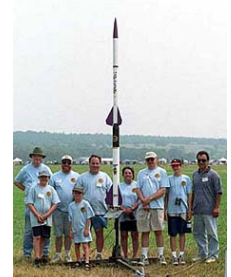
SRC Rocket WHAT'S UP

The LDRS website is located at http://ldrs31.org